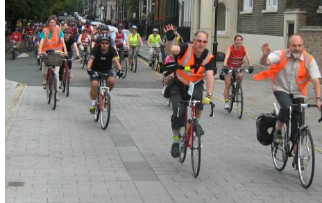
Leaving Highbury Fields