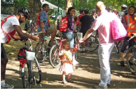
Getting ready for the 'off'