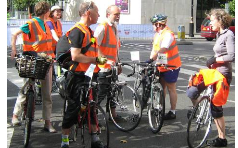
Our marshals at the end